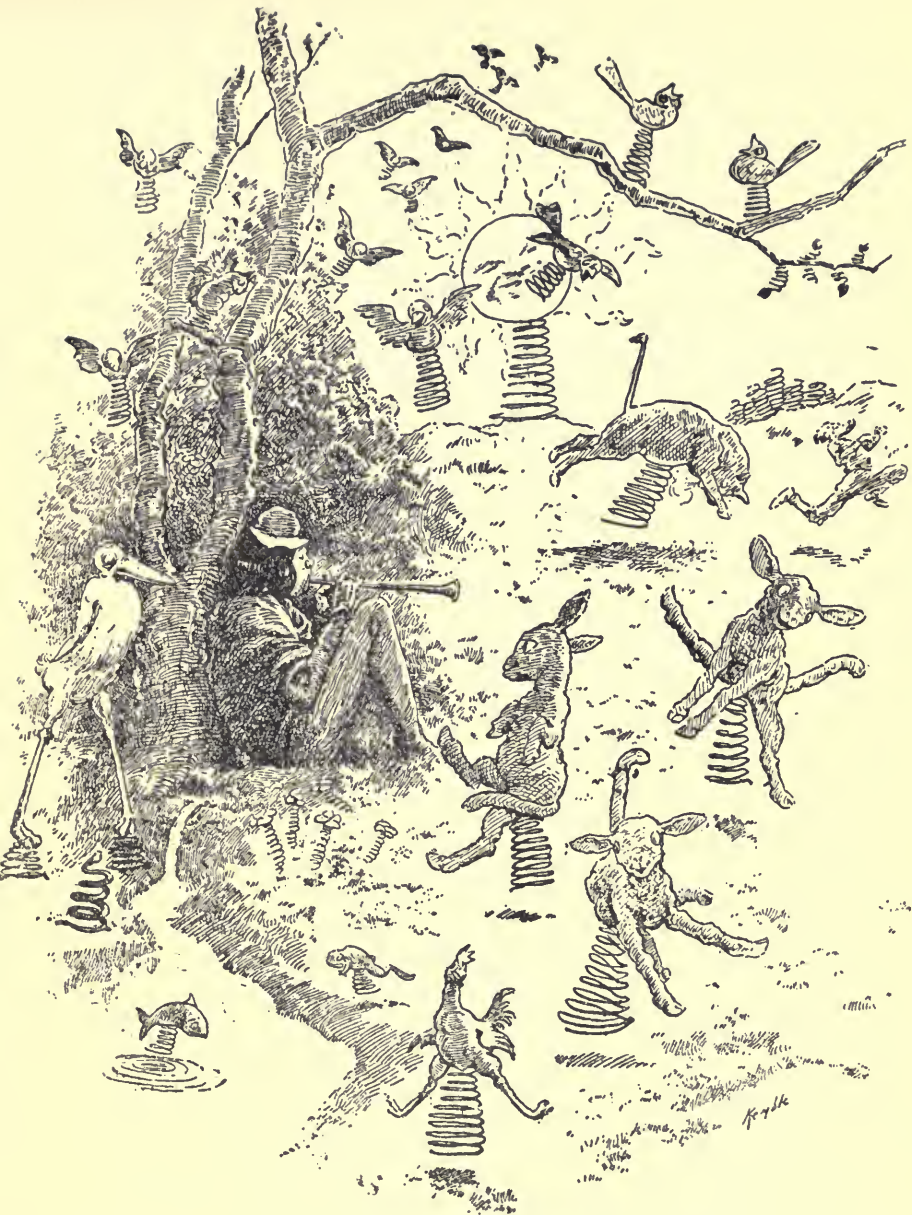
Spring, Gentle Spring